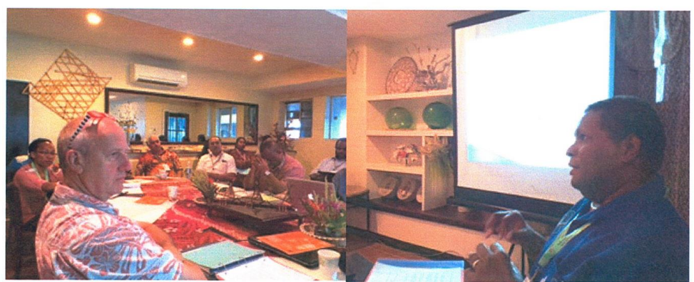
Figure 2: CEOs and Utility Representatives at the Consultation

The presentation on the project was then followed by one on the Environment and Social Management Framework (ESMF). CEOs and Utility representatives were advised that this was necessary under WB funding guidelines as Phase 2 of the RE Resource Mapping which would require ground measurements at selected spot following the outcome of Phase 1.