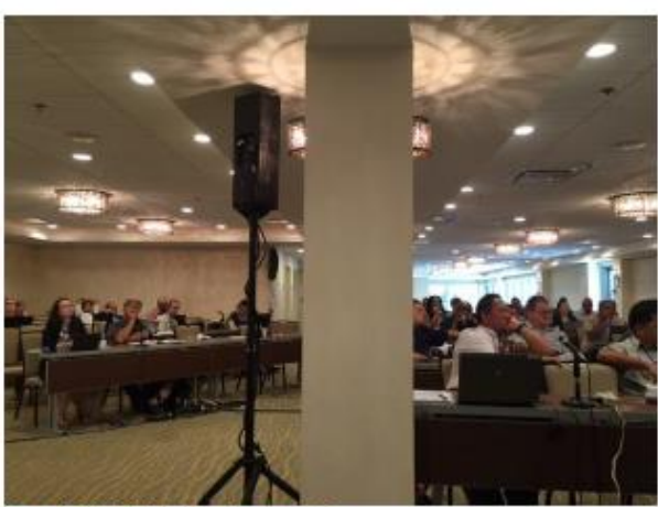
Figure 2: PICTs Officials during the consultation

Following the presentation, the Executive Director then invited comments and feedback from the officials on the project. The feedback from the officials was very positive as the project activities clearly addresses the gaps in knowing the level of RE resource and other relevant areas important to the island governments achieving the national RE targets