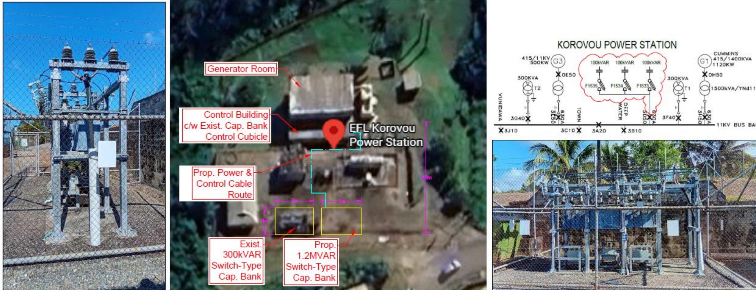
Figure 1: EFL Korovou Power Station Layout