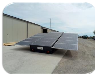
Trailer-Watt® Solar Trailer