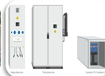
Solar Hybrid Box® Battery systems