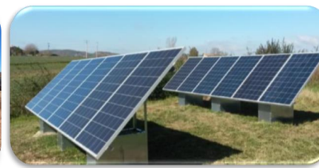
Mobil-Grid® - Mobil-Grid 500+ Solarfold® - Fix-Watt® Solar Containers