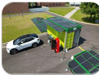
Frame-Watt® Solar Frame