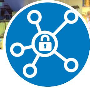
Network Infrastructure and Security