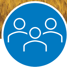
Community Awareness and Education