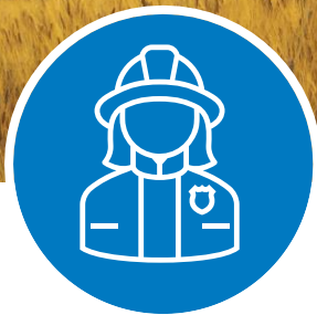
Emergency Services Support