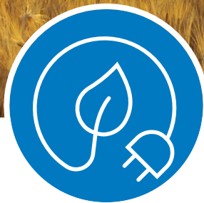
Efficiency- Resilience Nexus