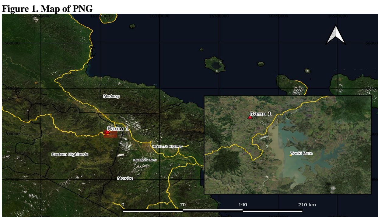
Figure 2. Map of Ramu 1 hydro Power Plant