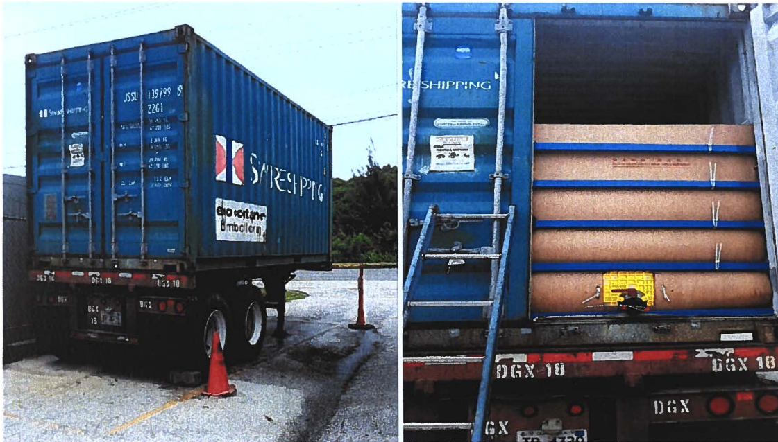
20' DELIVERY CONTAINER WITH UREA BLADDER