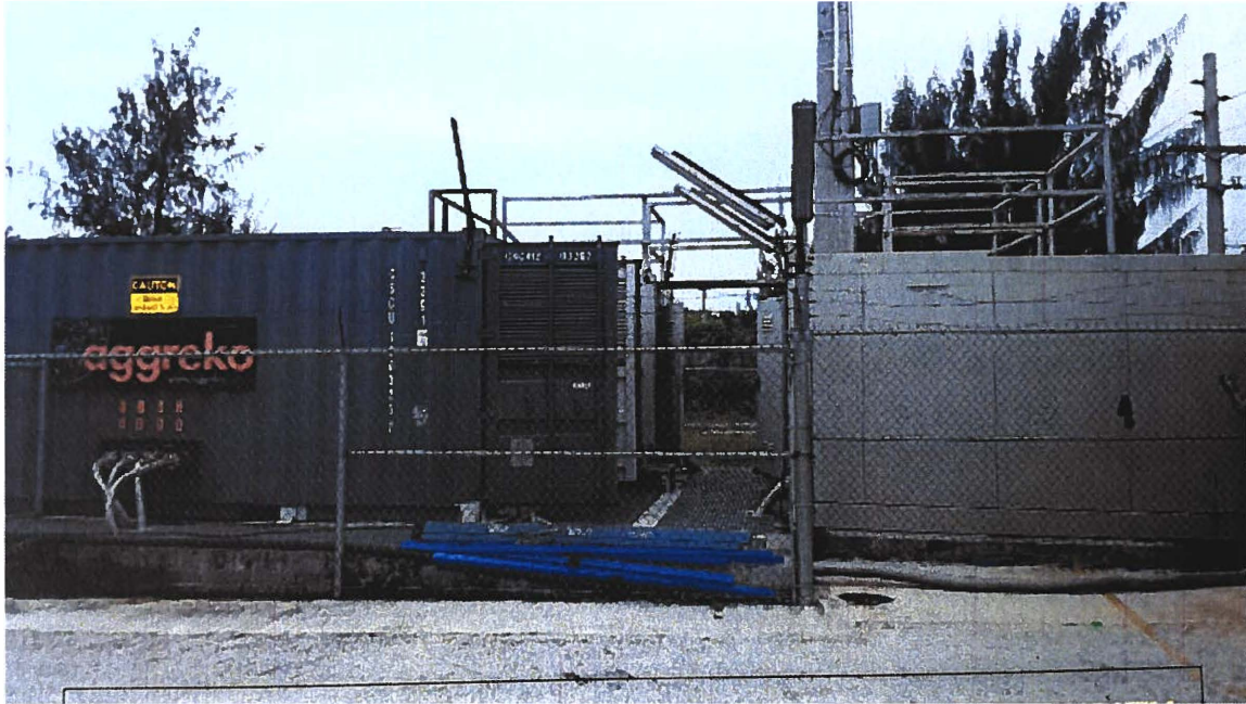
YIGO DIESEL POWER PLANT UREA STORAGE FACILITY