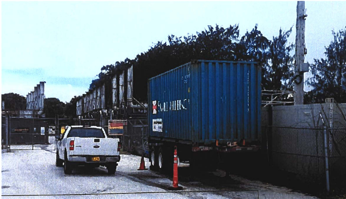
YIGO DIESEL POWER PLANT MAIN ENTRANCE