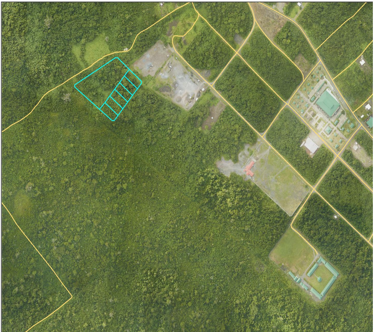
Figure 1: Aerial Image of the Project Site highlighted in light green (Uncultivated 7.5 acers)

EPC have just secured a long term lease with the Samoa Land Corporation of Government owned land to use 7.5 acers at Salelologa for the diesel project. Land is describe as lot 1043, 1044, 1045, 1046, 1047, 1048 and 1049 on Survey Plan 8099. The land is currently a vacant uncultivated with mostly occupied by overgrown trees and undisturbed push.