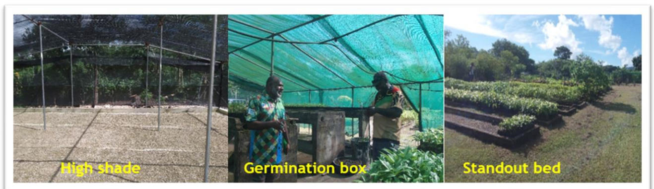
Figure 2 Current constructions at the Tagabe Nursery