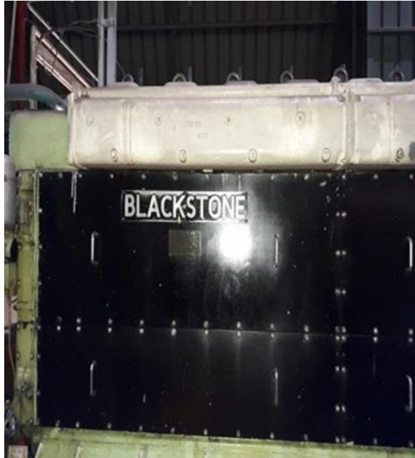
Figure 2: Side View