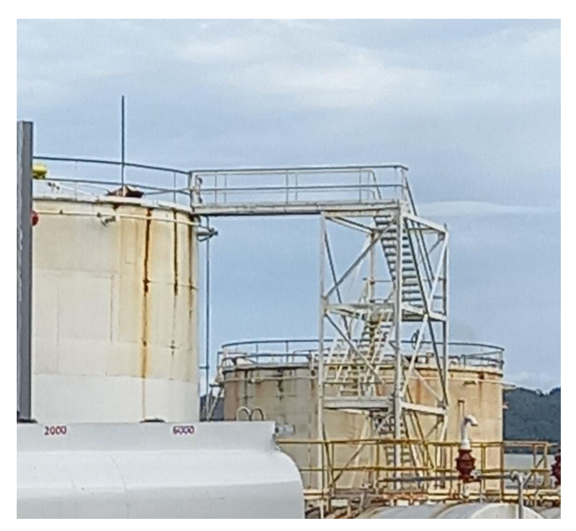
Figure 3: standalone tank access stairway as per the picture below