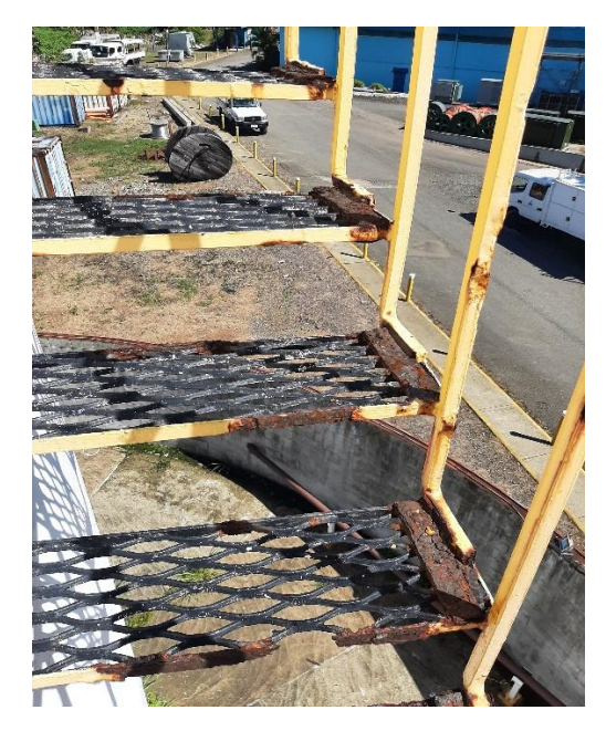
Figure 2: rusted portion of spiral stairway