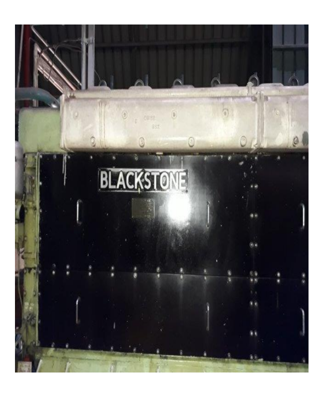
Figure 2 Side View