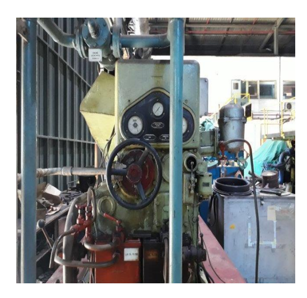
Figure 3 Front View