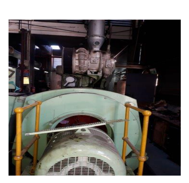
Figure 3 Side View