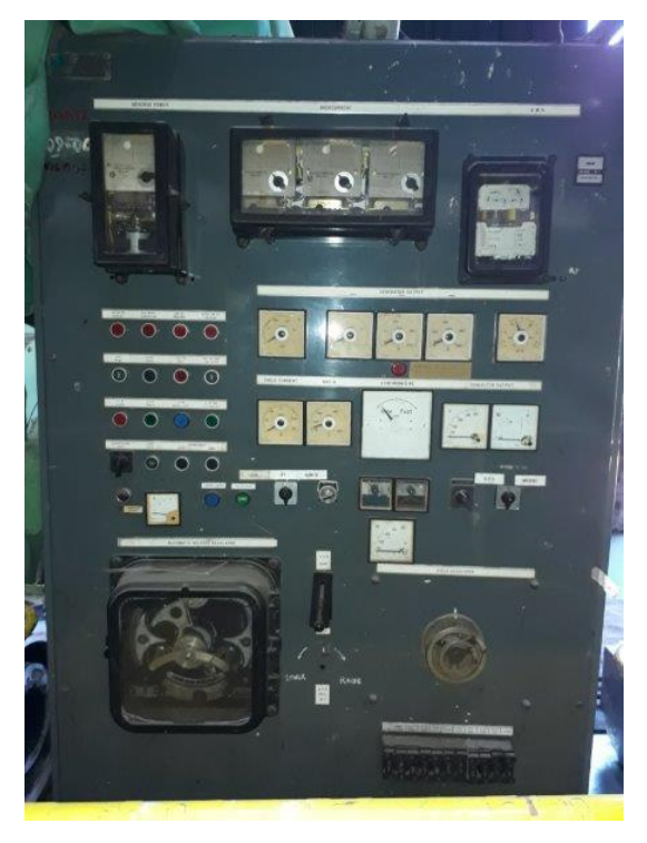
Figure 1 Control Panel