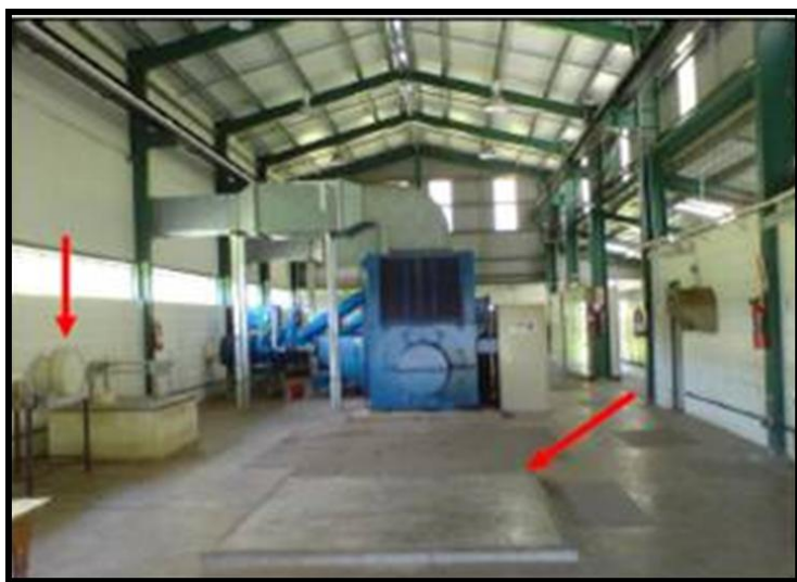
Figure 4: Space for third generator at Taelefaga power station.

Standards: The Contractor shall comply with standards as listed in Section 6; Part 2.1 and Part 2.4.