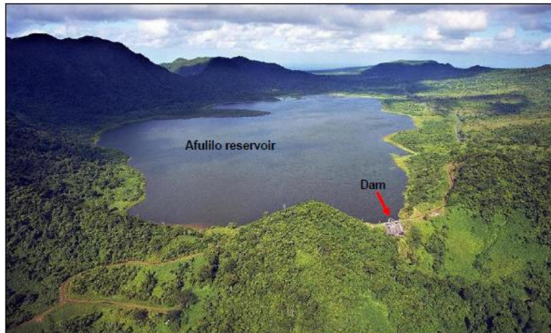
Figure 1 Afulilo Dam