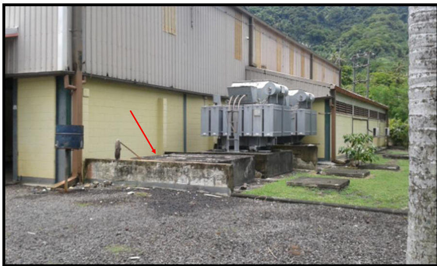
Figure 7: Taelefaga Station Step-Up Transformer pad for third generator