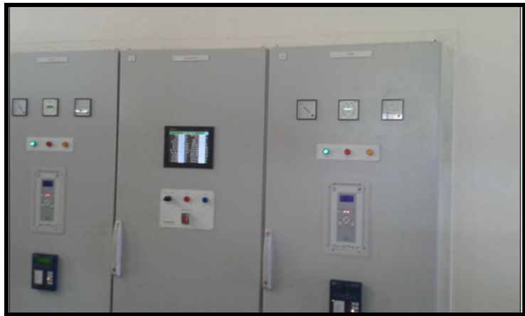
Figure 8: Taelefaga's Control Panel