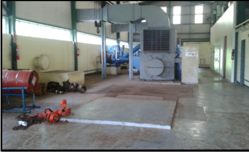
Figure 6: Third Taelefaga generator space