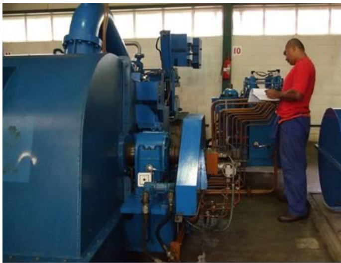
Figure 5: Taelefaga's Turbine